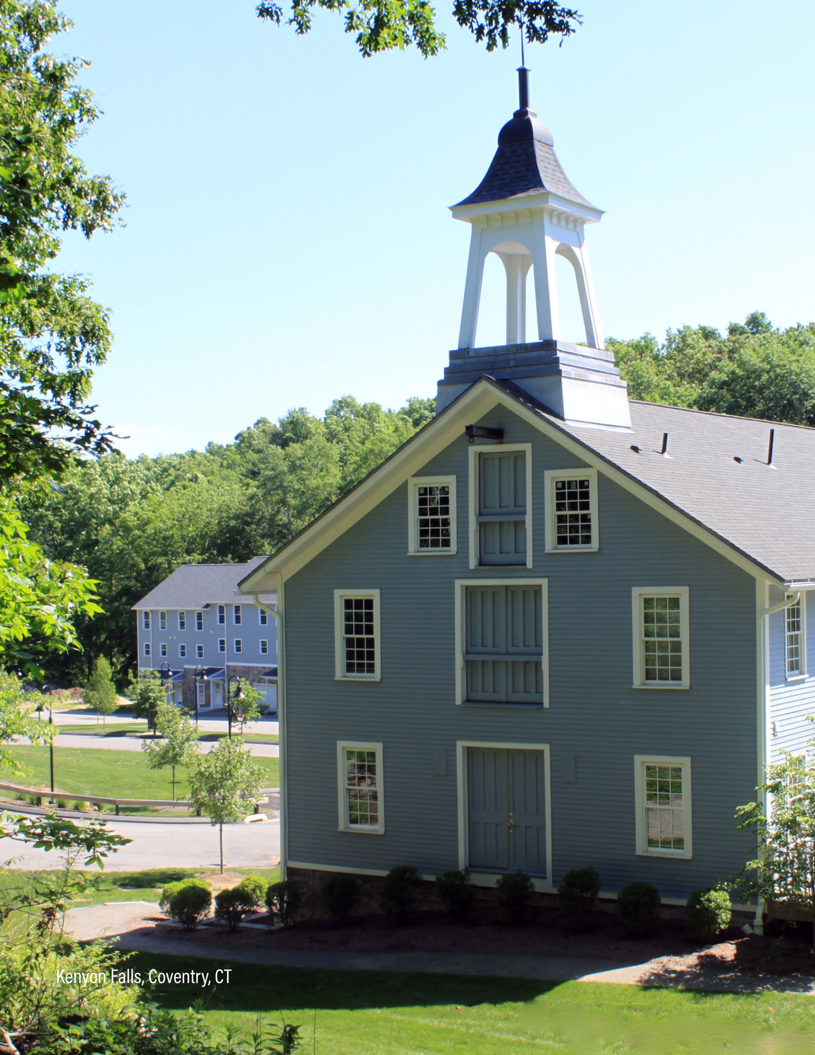
Kenyon Falls, Coventry, CT