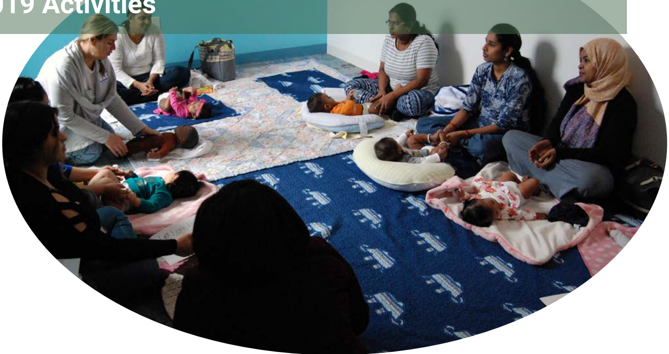
Louise Earle Loomis Children's Wellness Center at Capewell Lofts, Hartford, CT