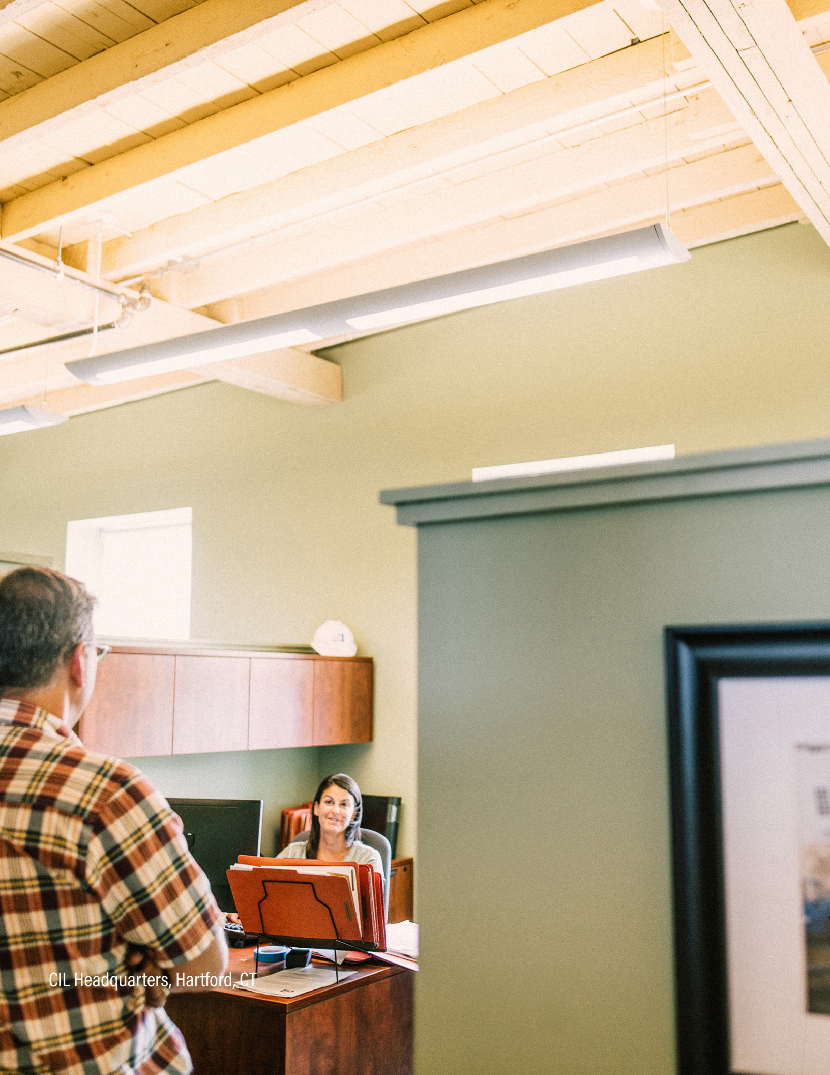
CIL Headquarters, Hartford, CT